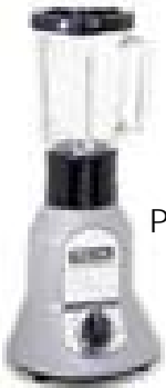
Viking Professional Blender