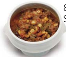
Set of 8 8 oz Footed Soup Bowls