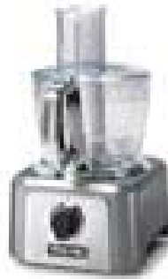
Viking 12 Cup Food Processor