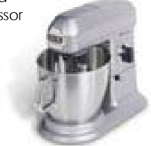
Viking 5 Quart Stand Mixer

Taste of Gourmet reserves the right to substitute rewards with equal or greater value.