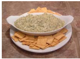
Set of 8 10" Oval Au Gratin Dishes